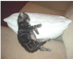
"Hmmmm. this is the life!"

The buildings are heated, at no extra cost to our clients; well lit natu- rally by windows on all sides; and lights at night; insulated & indoors. 4 pens have windows direct onto the garden, for the more curious cat [peak season only]!